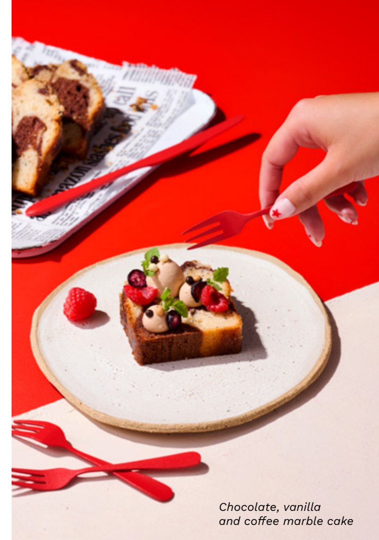
Chocolate, vanilla and coffee marble cake