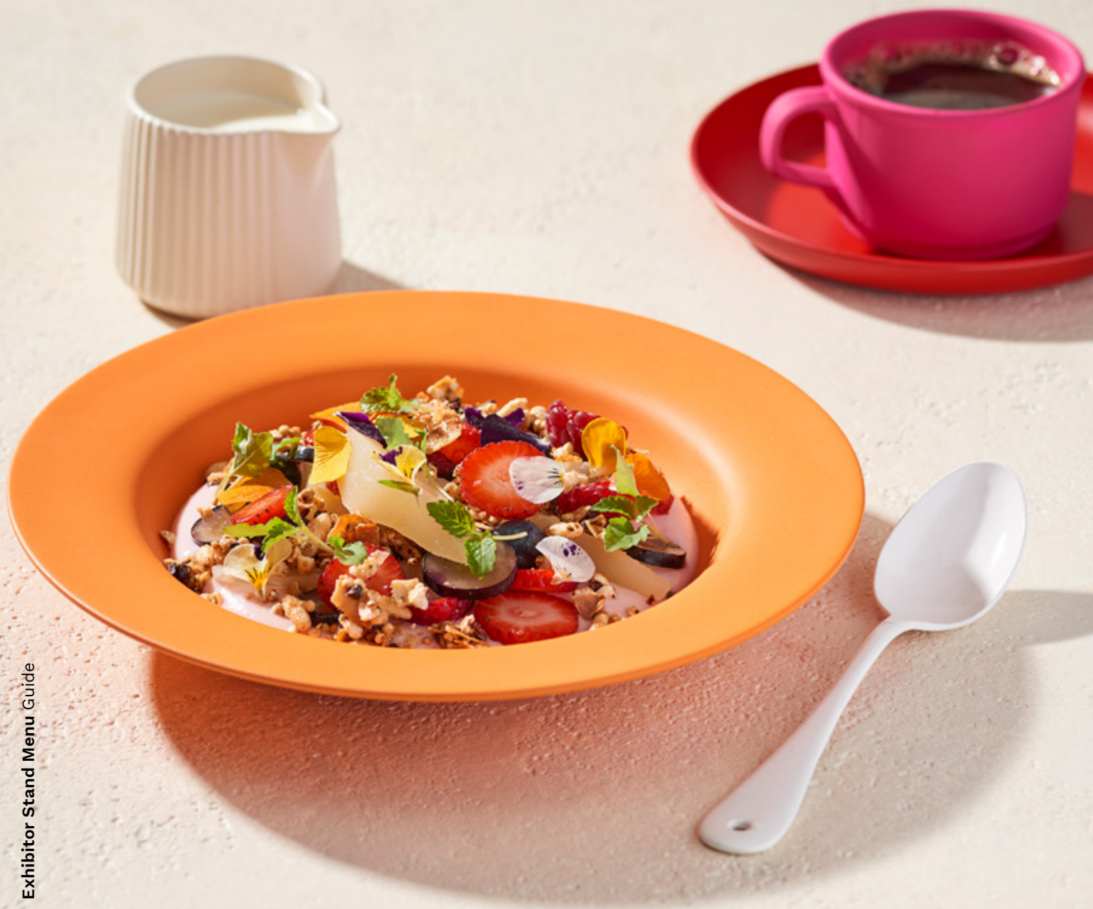
Strawberry gum yoghurt with blueberries and granola