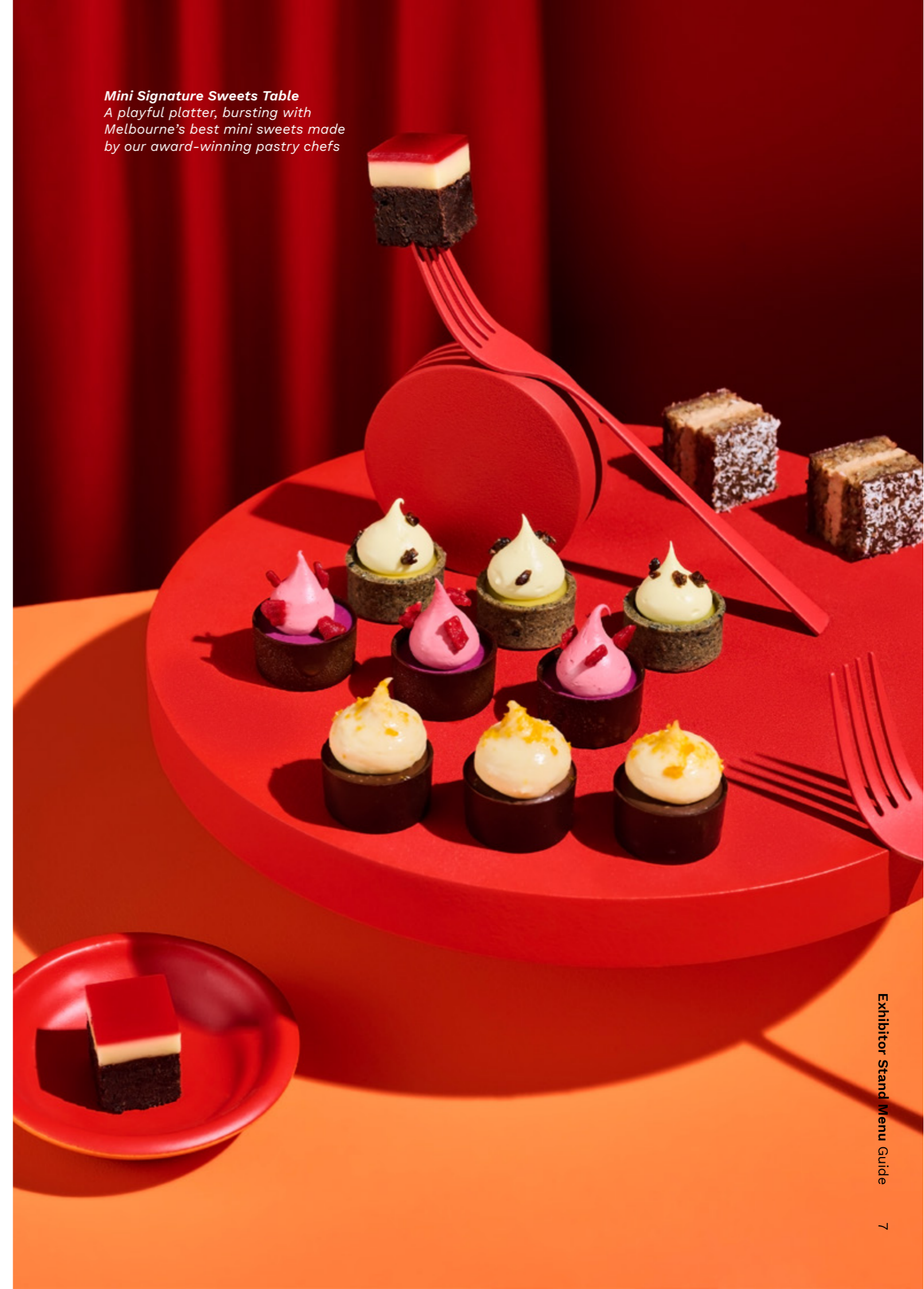
Mini Signature Sweets Table A playful platter, bursting with Melbourne's best mini sweets made by our award-winning pastry chefs